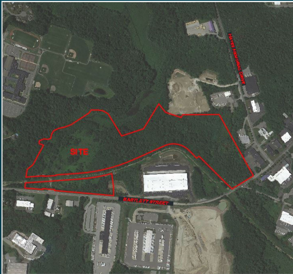
Site Locus – Not to Scale

Parcel H Development 0 & 301 Bartlett Street