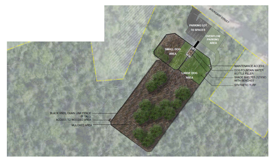
Page 5 of 6

Adding a dog park to Northborough's recreational facilities was identified as a priority both in the Master Plan as well as in the Open Space Plan. Community Preservation Act (CPA) funding in the amount of $35,500 was allocated to preliminary design. A CPA appropriation of $347,500 was appropriated toward the final design and construction.