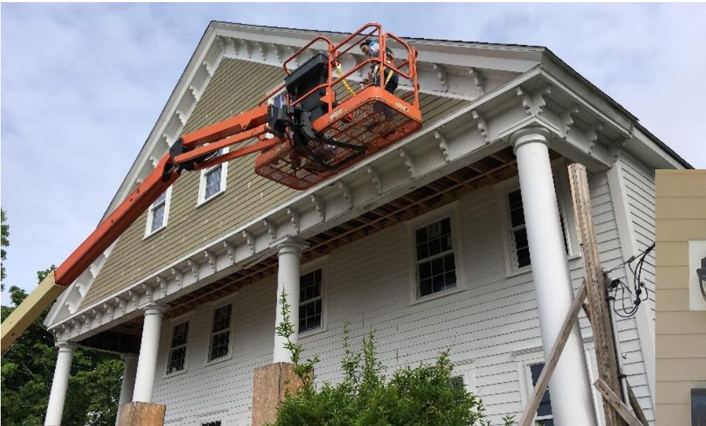
(4) Apartments at 33-39 Main: Project completed 2019 with CPA Funds and partnership with Habitat for Humanity